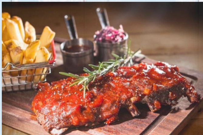
Half US Baby Back BBQ Ribs 美式烤豬仔骨