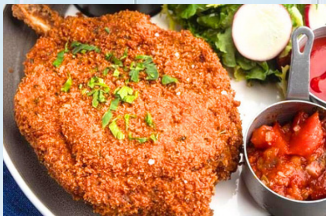
Polish Pork Schnitzel 波蘭香炸豬扒