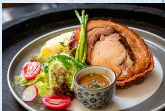
Housemade Roasted Porchetta 脆口香草羅馬式烤豬腩卷