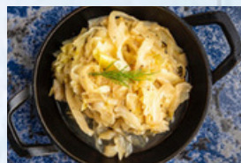
Sauerkraut Cabbage 酸椰菜