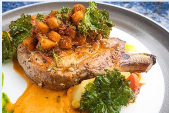
Canadian Pork Chop 香煎加拿大豬扒